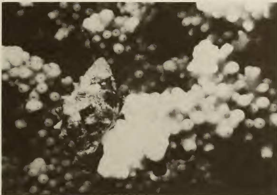
Plate Underwater photograph showing Drupella cornus feeding on a branch of Acropora hemprichi at the exact borderline of an active White Band Disease.

In very high densities, up to condition 5, D. cornus was only found at Ras umm Sidd (frequent completely stripped colonies, most colonies with stripped branches, over 20%, and up to 60%, of all colonies affected). These are elevated levels even when compared to values of high Drupella frequency obtained by Schuhmacher et al (1995) from Aqaba (1% coral death on average for the whole shallow reef, up to 30% tissue depletion).